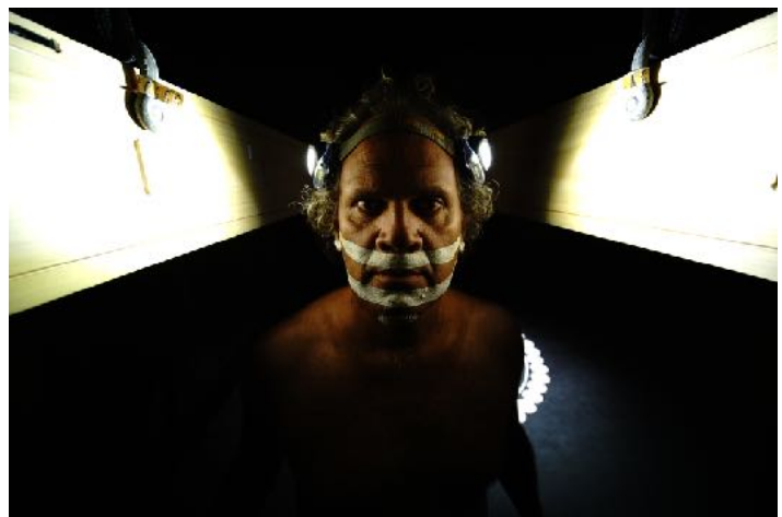
Spirit: Cure, Judith Wright Centre of Contemporary Arts, Brisbane 2019